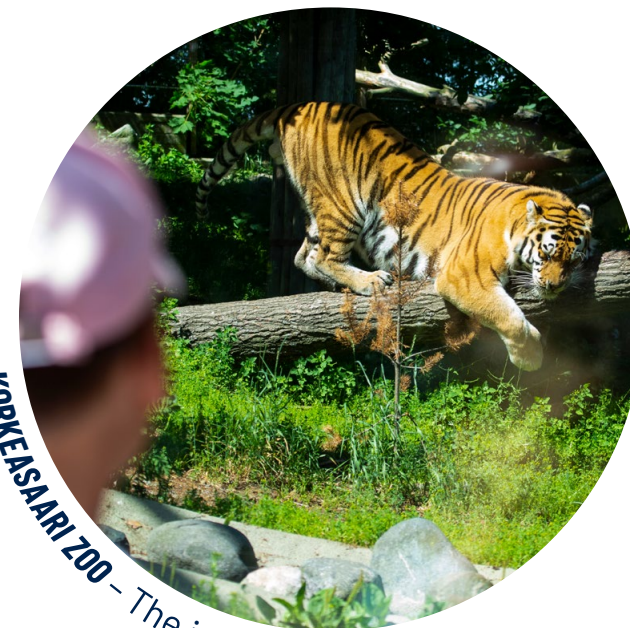
KORKEASAARI ZOO – The island of animals