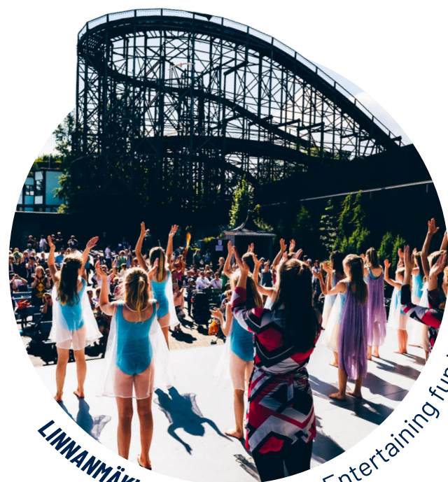
LINNANMÄKI AMUSEMENT PARK – Entertaining fun loving people