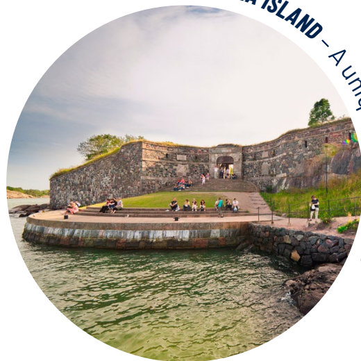
SUOMENLINNA ISLAND – A unique sea fortress