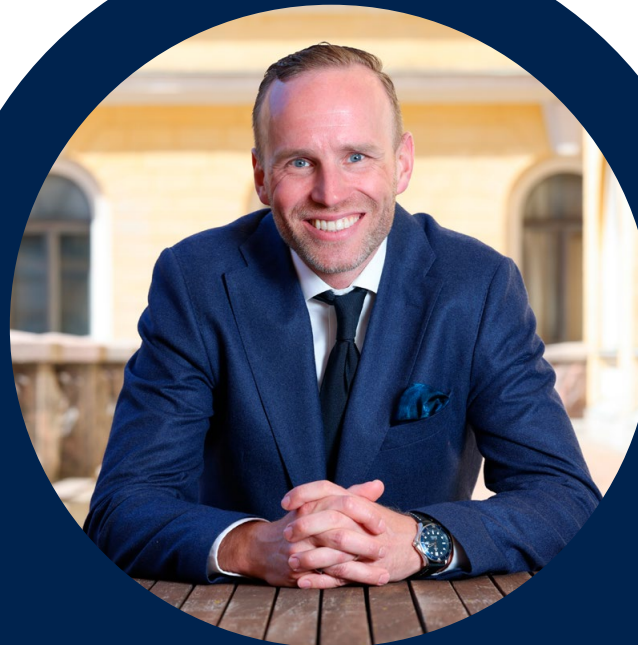
Mika Poutala Minister of Youth, Sport and Physical Activity

I warmly invite you to join us in building a sustainable and inclusive future for physical activity – together.