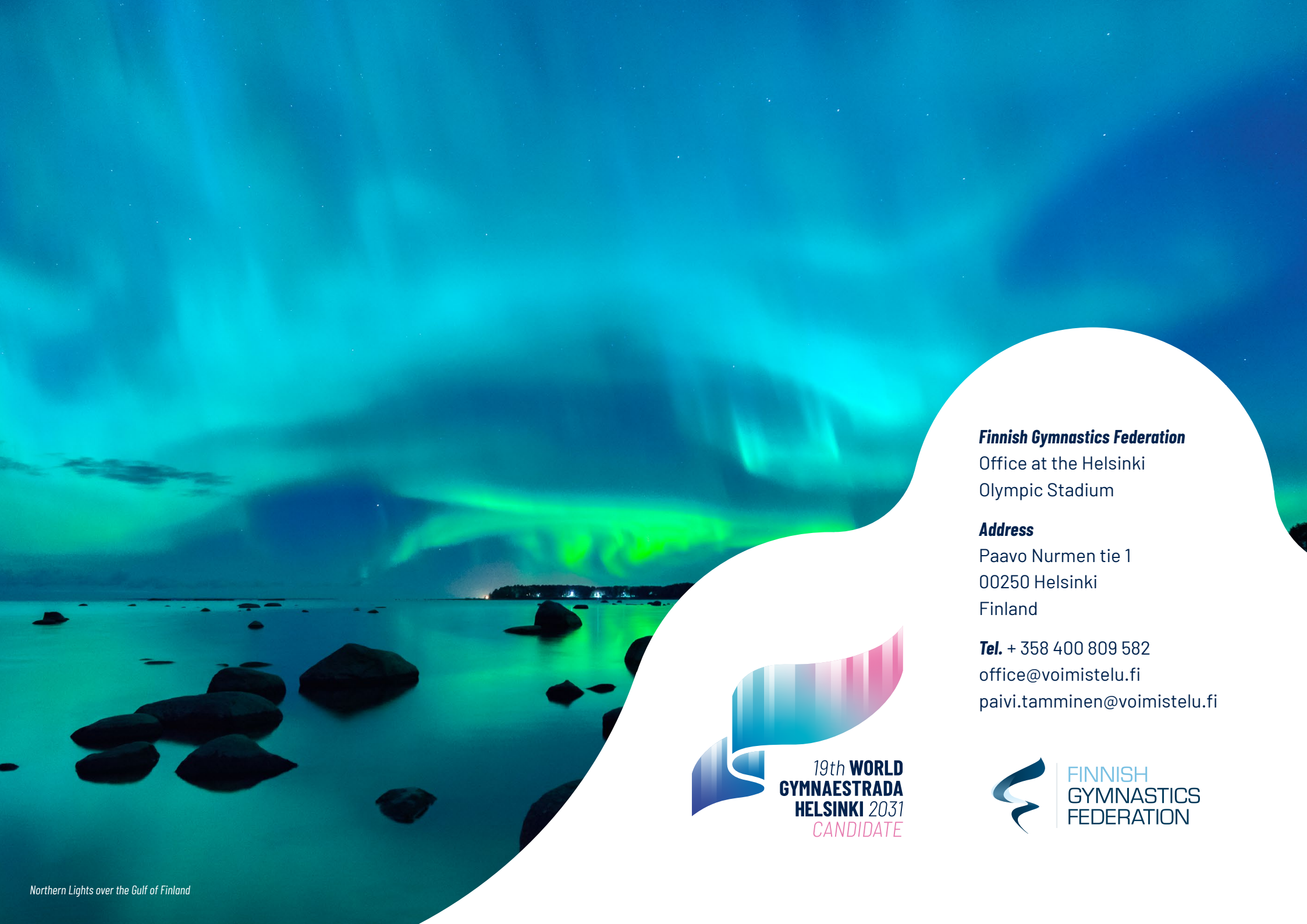
Northern Lights over the Gulf of Finland