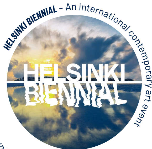
HELSINKI BIENNIAL – An international contemporary art event